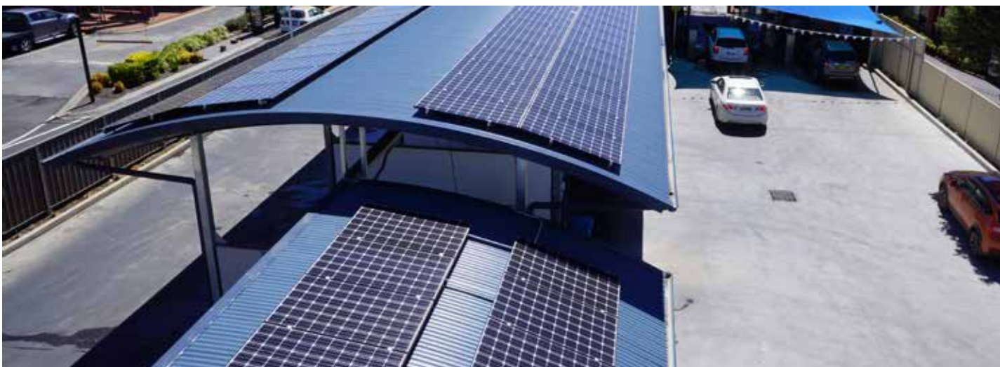
40 kW LG NeON system, carwash, Bathurst

Subject to the terms in this document, LG will for a period of fifteen (15) years from date that the system was originally installed authorise a free of charge replacement of the module, if in LG's opinion it needs replacement because of a manufacturing or materials defect appearing within and notified to LG in accordance with this warranty. This warranty is only applicable to modules under normal applications, installations, use and service conditions.